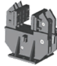
C30B For Concrete pile (Cubic pile)