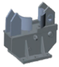
C35E For Concrete pile (Column pile)