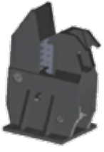
C17 For H-beam/Sheet pile