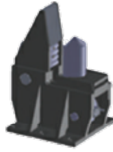
C12G For tube