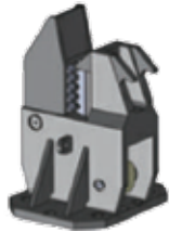
C19 For Sheet pile